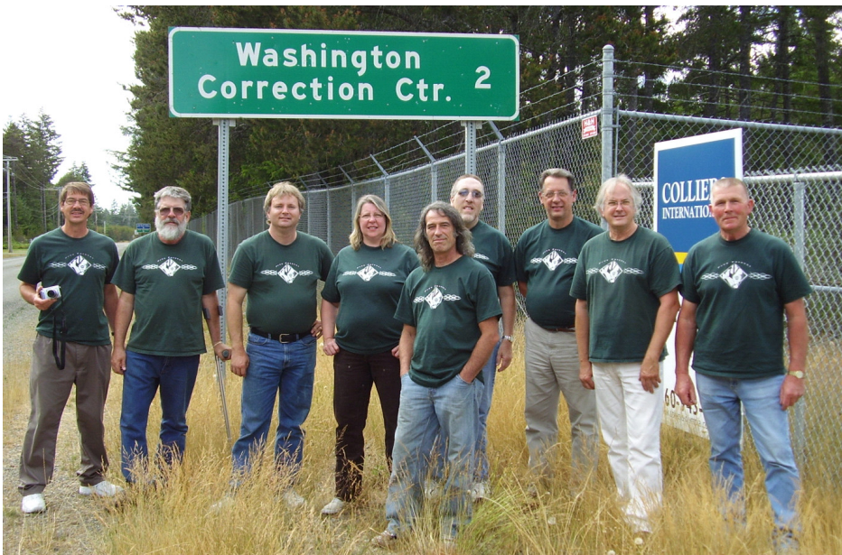
Members of the 2009 Shelton Revival Team that led Chapel Services for the facility's inmates on July 19

Prison Mission Association has sponsored and coordinated annual large scale evangelistic meetings at the Washington Correction Center in Shelton for more than 11 years. This year's event was held July 17-19 and turned out to be one of the most successful in recent memory. Each of the 8 units in the prison was given opportunity to attend the various programs that were presented by the teams that participated.